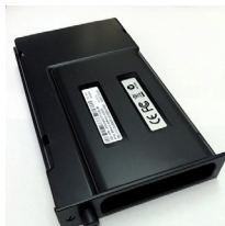
DC Adapter 6603-6500-0500