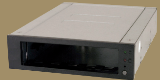
DX115 DC Frame