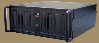
RAX845DC- 4U 8Bay