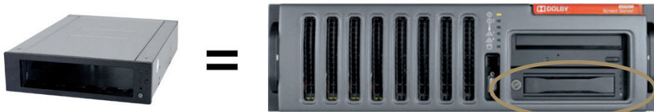
DX115 DC Frame Only 6602-6500-0500