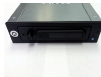
DCmini Cartridge + Adapter in DX115 DC Frame